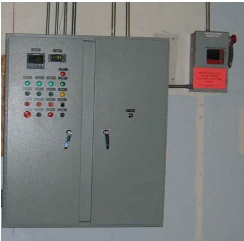
The new double door control cabinet.