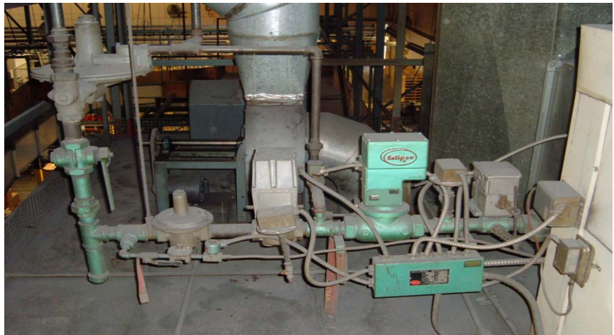
The picture shows the old gas train.