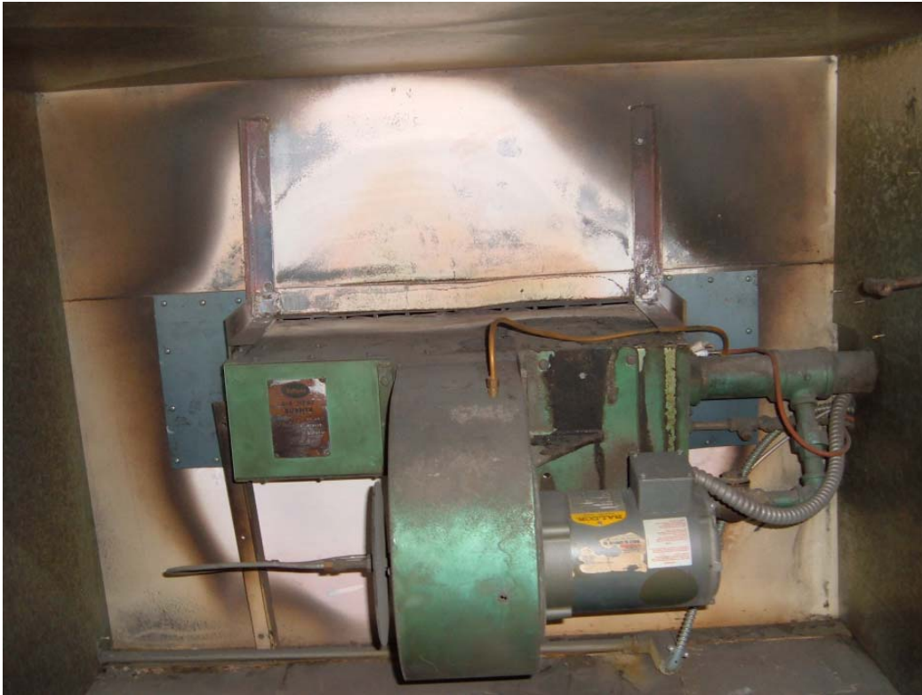
The picture shows the old burner with the heat damaged wall.

Bogh Industries LLC has completed a rework and upgrade of a powder cure oven located in Washington. The oven is an older panel oven installed in 1988. The oven had, over the years, experienced burnout in the burner box due to rich flame impinging the wall. Several repairs had been completed but a new repair was required due to the condition of the burner and burner box. The burner also showed significant damage due to burn back. (Wiring in a junction box was found to be melted together).