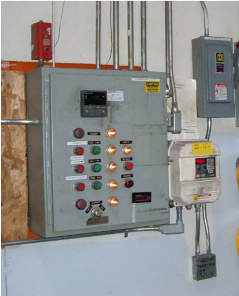
The old control cabinet.