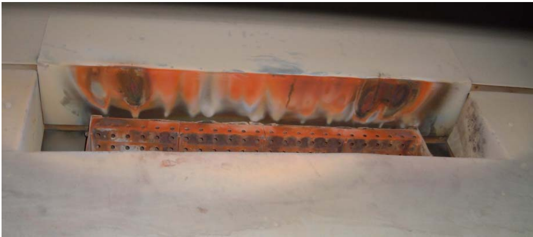
This picture show the inside of the burner box.